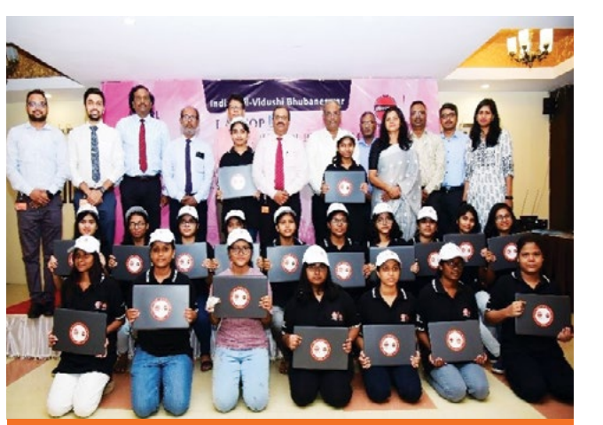
tudents of the IndianOil Vidushi programme, Bhubaneswar Centre receiving laptops and accessories for online classes

Since inception of the program 532 girls have been coached out of which 54 girls secured admissions in IITs, 93 Girls in NITs and 153 girls got admitted to other govt. college. Out of 119 girls coached in 2022-23, 68 have cleared JEE mains. The project also offers scholarships to students who successfully secure admission to IITs, NITs, and government engineering colleges, providing financial support throughout their four-year undergraduate programs. The scholarship amount is ₹5,000 per month for students in IITs and NITs, while students enrolled in other government engineering colleges receive ₹4,000 per month. Since inception 197 girls have been awarded with Vidushi Scholarships. The IndianOil Vidushi project embodies the commitment of IndianOil towards empowering and enabling underprivileged girls to pursue higher education in engineering, creating a positive ripple effect in their lives, communities, and the nation as a whole.