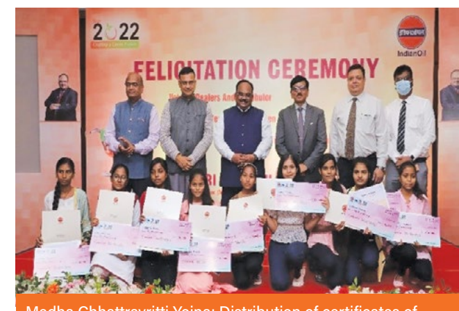
Medha Chhattravritti Yojna: Distribution of certificates of excellence and scholarships to meritorious girl students of Class X, Jharkhand Board

The IndianOil Medha Chhattravritti Yojna has benefited girls 3490 girls across the country in last 2 years, For 2022-23, 1884 girls who outperformed in academic session 2021-22 were awarded with the meritorious scholarship. By promoting education and supporting deserving students, the IndianOil Medha Chhattravritti Yojna plays a significant role in reducing the dropouts and increasing women participation in higher education, which in turn helps in the overall progress and advancement of the country.