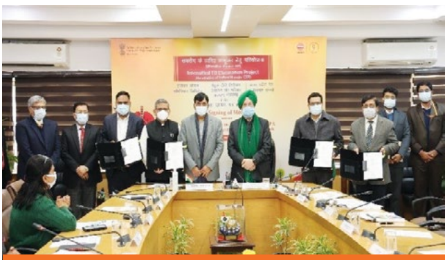
MoU signing ceremony between IndianOil, Central TB Division and the states of Uttar Pradesh and Chhattisgarh for Intensive TB Elimination Project

IndianOil along with the Central TB Division (CTD), MoH&FW and the states of Uttar Pradesh, Chhattisgarh, Maharashtra & Uttarakhand is working towards achieving the TB elimination goal. Under the project, IndianOil is supplementing the efforts of Gol in the above mentioned 4 states for early diagnosis of TB. The project includes provision of 251 Molecular diagnostic machines, 49 handheld X-ray machines, 18 mobile medical vans for diagnosis of TB and running Active case finding campaign at an estimated total cost of about ₹ 79.0 Crore. The project is expected to touch lives of around 4 Lakh patients in the 4 states annually.