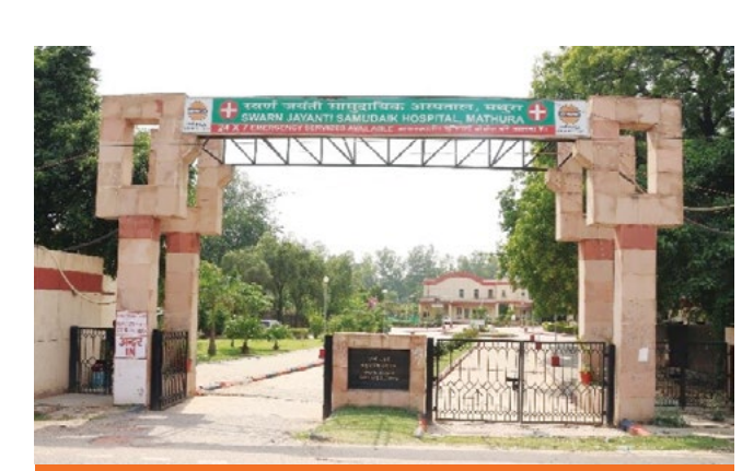
Swarna Jayanti Samudayik Hospital, Mathura, UP

The hospital actively engages with the local community to promote healthcare awareness and preventive measures. The hospital conducts health camps in nearby villages, where free medical check-ups and consultations are provided to underprivileged individuals. Additionally, awareness programs on topics like hygiene, sanitation, nutrition, and family planning are organised to empower the community with essential health-related knowledge. The hospital treats an average of over 45000 patients every year. Beyond medical services, the hospital also plays a crucial role in addressing emergency situations and providing relief during natural calamities. Swarna Jayanti Samudayik Hospital stands as a shining example of how corporate entities can contribute meaningfully to society by addressing the pressing healthcare needs of the community.